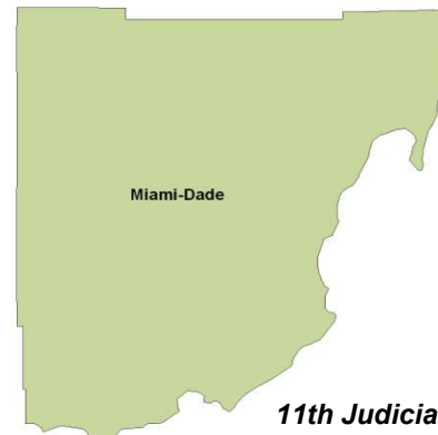
11th Judicial Circuit