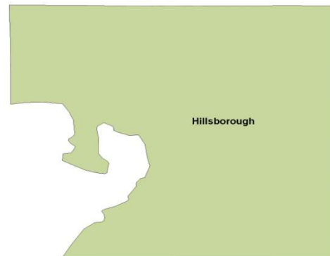
13th Judicial Circuit