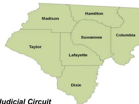
3rd Judicial Circuit