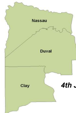
4th Judicial Circuit