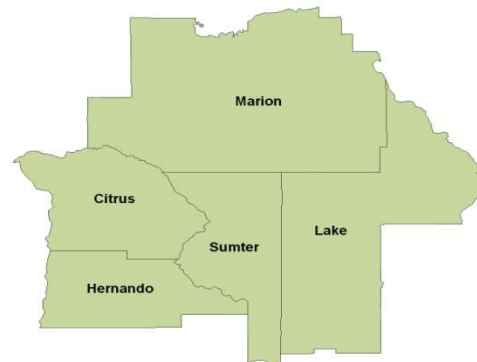
5th Judicial Circuit