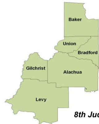
8th Judicial Circuit