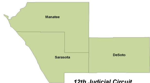
12th Judicial Circuit