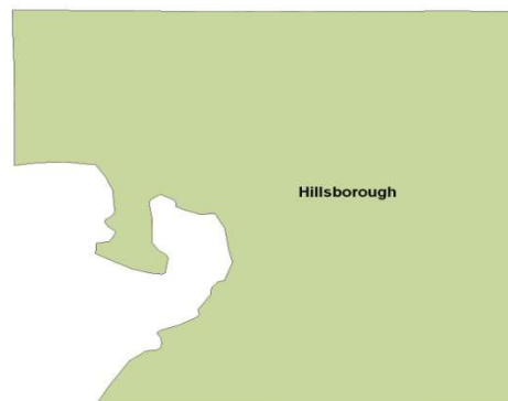
13th Judicial Circuit