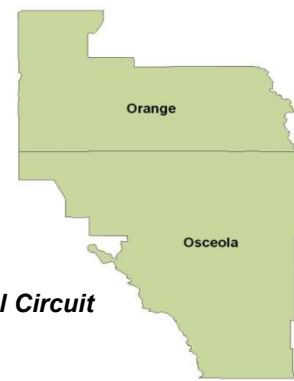
9th Judicial Circuit