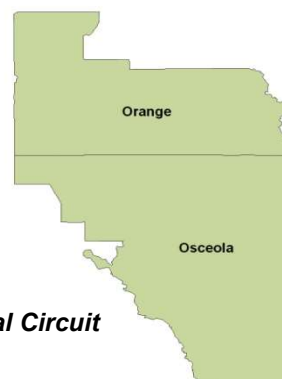
9th Judicial Circuit