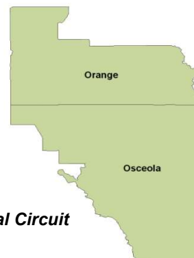
9th Judicial Circuit