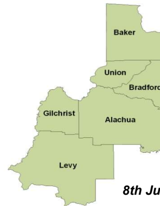
8th Judicial Circuit