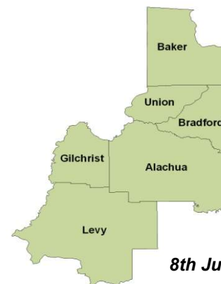
8th Judicial Circuit