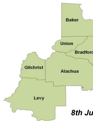
8th Judicial Circuit