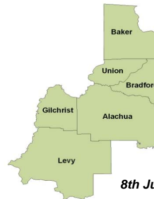
8th Judicial Circuit