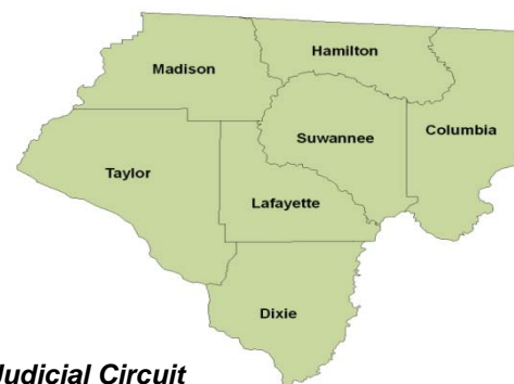
3rd Judicial Circuit