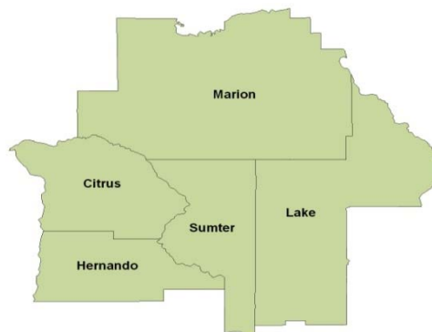
5th Judicial Circuit