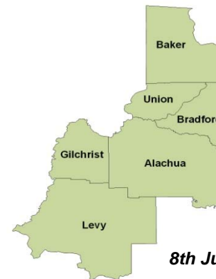
8th Judicial Circuit