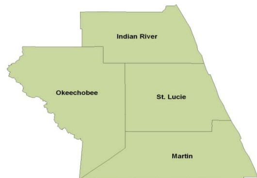
19th Judicial Circuit