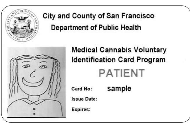
Figure 2: Example of San Francisco's Medical Marijuana Registry Cards