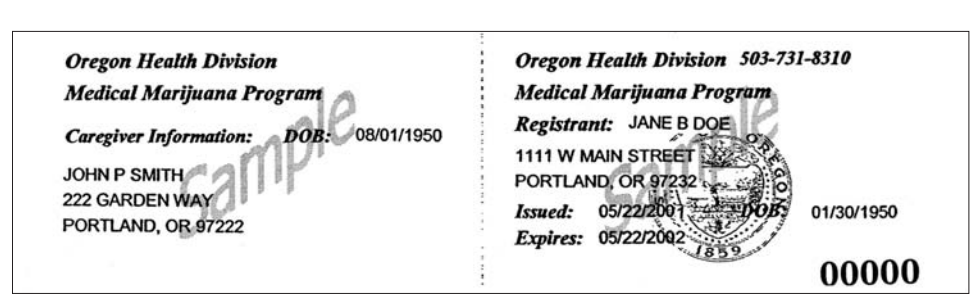
Figure 1: Example of Oregon's Medical Marijuana Registry Card